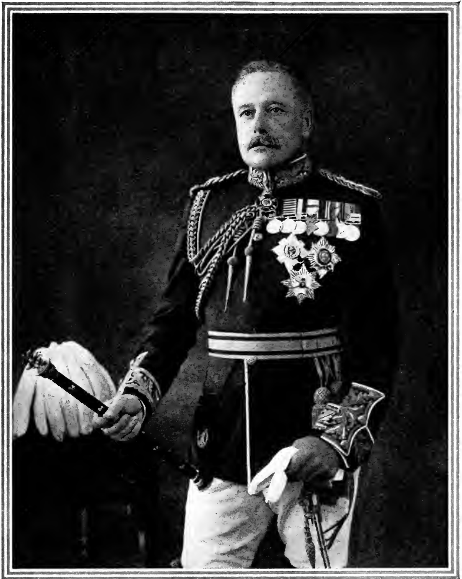
FIELD-MARSHAL EARL HAIG, O.M.